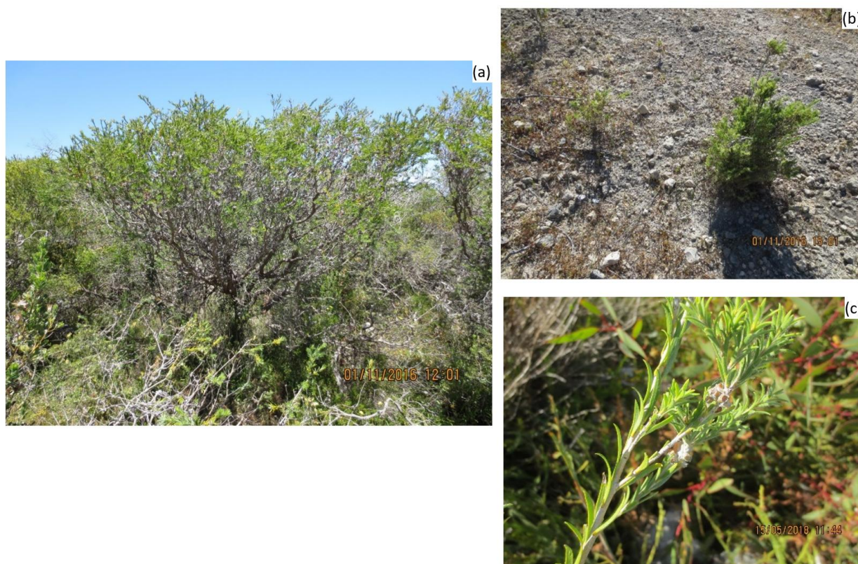
Figure 1. Photos of Melaleuca sp. Wanneroo

Notes. (a) Healthy mature Melaleuca sp. Wanneroo shrub, (b) Small juvenile of Melaleuca sp. Wanneroo, and (c) Melaleuca sp. Wanneroo leaves.