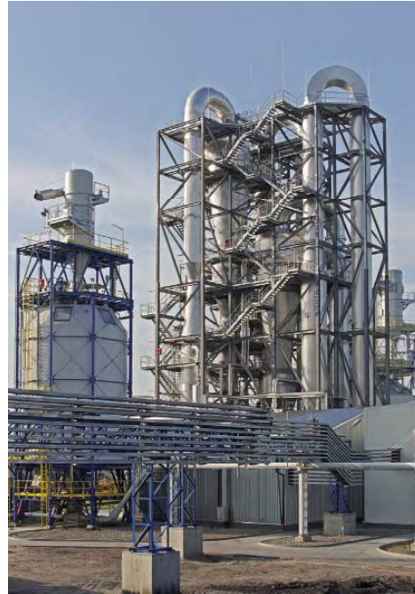
Facilities built and in operation: 50 tons/hr biomass system – Stalowa Wola, Poland (2012)

Staffan Bauman Swedish Exergy AB B166/3931/DN