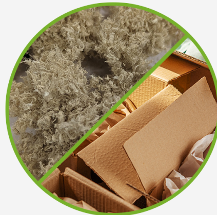
RECYCLED BOARD & SLUDGE