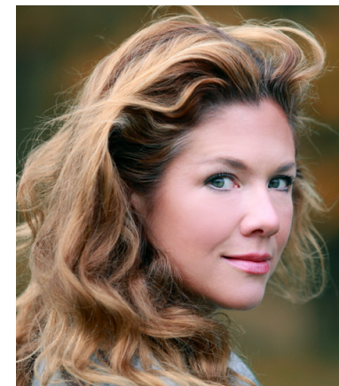
Sophie Grégoire Trudeau Official FitSpirit spokesperson

In recent years, girls' and women's issues have come to the forefront of our conversations as a society. More and more people are uniting their voices to change things for good.