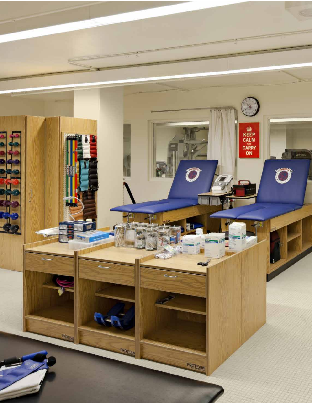
Anacostia High School - Washington, DC