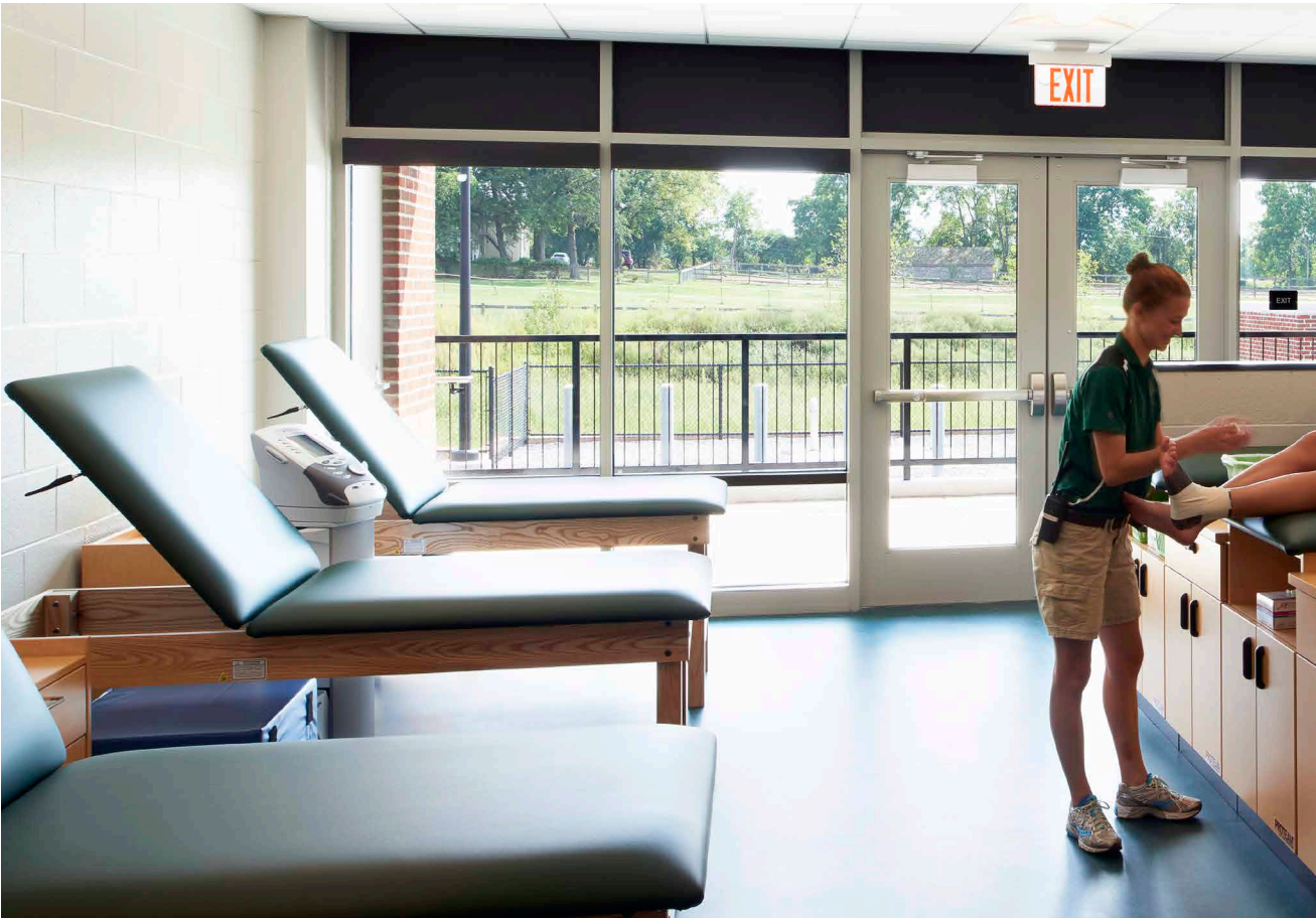
George School - Newton, PA