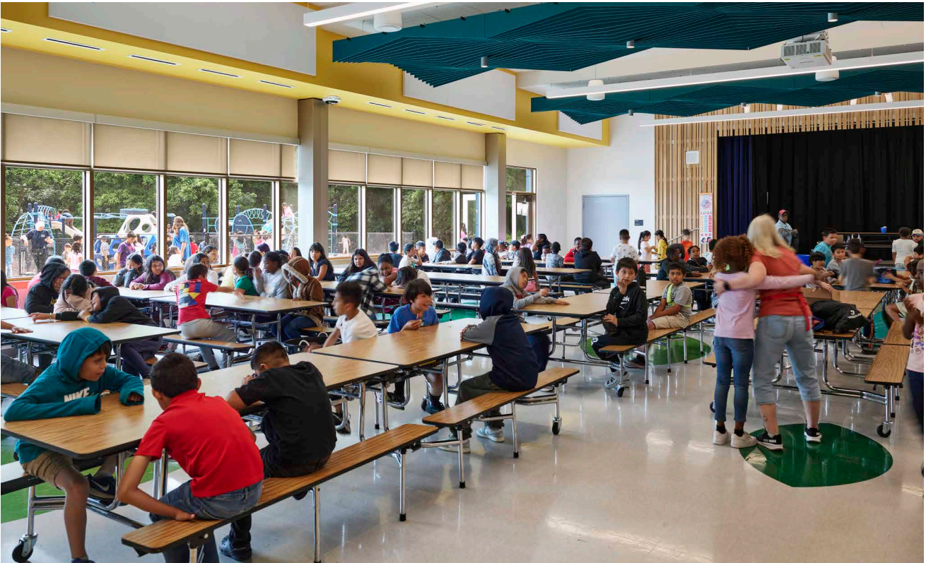
Folsom-Cordova Unified School District - CA