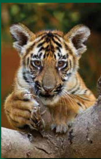
Young tiger in Tadoba reserve in India.