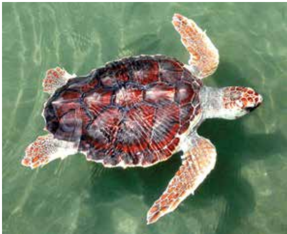
A young loggerhead sea turtle photographed near Panama City, Florida.

If you are able to write checks from your IRA account, it’s important to mail those at least several weeks before the end of the year in order to qualify for the charitable distribution. Unlike other checks for charitable gifts, the date of the gift for IRA donations is when the funds are actually transferred by your IRA administrator not the date of the postmark when you mail the check.