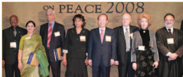
MEMBERS OF UPF'S PRESIDING COUNCIL AND GLOBAL PEACE COUNCIL

The ILC programs have developed to address this need. The ILC series gives emphasis to the development of a new model or paradigm for leadership and good governance at this time in history; a model that is innovative, principled and effective in solving global problems.