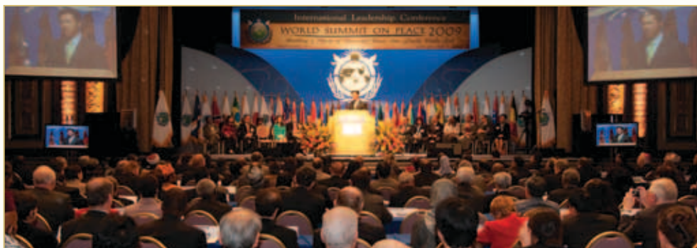
THE UPF INTERNATIONAL LEADERSHIP CONFERENCE 2009, NEW YORK CITY.

The Universal Peace Federation affirms a model of leadership and good governance guided by the principle of “living for the sake of others”; a model that balances in a mature way, both spiritual and secular perspectives, and one that functions collaboratively with representatives of inter-governmental organizations, faith based organizations, the private sector and civil society.