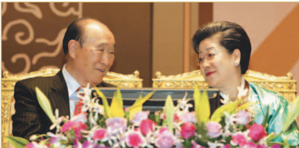
DR. AND MRS. SUN MYUNG MOON FOUNDERS OF THE UNIVERSAL PEACE FEDERATION.

The Universal Peace Federation is a global network of individuals and organizations committed to peace dialogue, education and service. UPF programs engage leaders representing a wide range of fields and areas of interest, including government, civil society, religion, academia, the media, the arts, sports and the private sector. Since its inaugural assembly in 2005 the UPF has seen remarkable growth and progress. UPF's Ambassadors for Peace are engaged worldwide in a determined effort to bring civil society solutions to critical global problems.