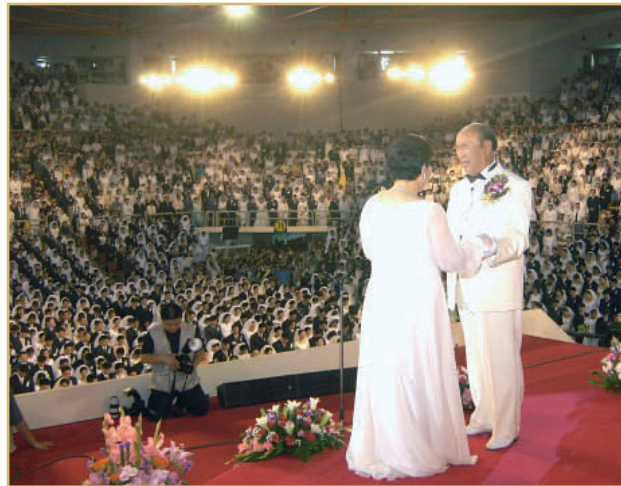
DR. AND MRS. SUN MYUNG MOON OFFICIATING AT THE WORLD PEACE BLESSING

the sanctity of marriage and inviting people to participate in a World Peace Marriage Blessing. Participants in these joint celebrations declare their commitment to peace across all boundaries including national origin, culture, race and religion as they make the most sacred of commitment of their life: marriage and family.