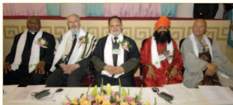
RELIGIOUS LEADERS OF ALL TRADITIONS OFFER PRAYERS OF BLESSING AND PEACE UPON ALL BLESSING PARTICIPANTS

This emphasis on the sanctity of marriage enjoys wide support. World Peace Blessings typically include invocations by leaders from Islam, Judaism, Christianity, Buddhism, and other religions.