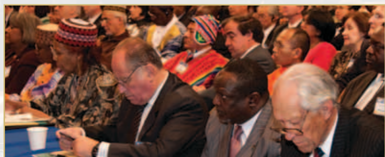
PARTICIPANTS AT WORLD SUMMIT FOR PEACE 2009, NEW YORK CITY

The ILC program introduces essential, universal values, principles and practices that are necessary to create a world in which people of every region, race, nationality, culture and religion live together in peace. We will consider the root causes of conflict and the ways we can move together from states of conflict, inequality, poverty and enmity toward reconciliation, cooperation and prosperity as one human family under God.