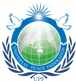
Universal Peace Federation

Founded by the Reverend Dr. Sun Myung Moon and Dr. Hak Ja Han Moon, on the foundation of the Unification Church, the Family Federation for World Peace and Unification is comprised of families striving to embody the ideal of true love and to establish a world of peace and unity among all peoples, races, and religions. FFWPU is widely known for its holy marriage ceremonies, known as the Blessing. FFWPU is based on Reverend Moon's religious teaching, the Divine Principle.