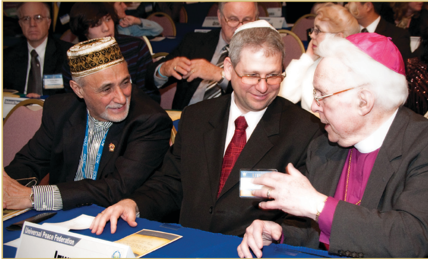
PARTICIPANTS AT AN INTERNATIONAL LEADERSHIP CONFERENCE, JANUARY 2009, NEW YORK CITY.

There is a growing awareness among people throughout the world of the urgent need for innovative vision and courageous leadership if we are to resolve the critical issues of our time.