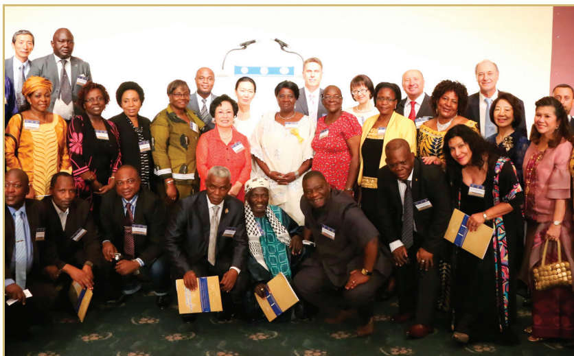
PARTICIPANTS AT AN INTERNATIONAL LEADERSHIP CONFERENCE, SEOUL, KOREA, AUGUST 20–23, 2013.

ILC PROGRAMS HAVE BEEN HELD THROUGHOUT THE WORLD, BRINGING TOGETHER THOUSANDS OF LEADERS FROM ALL WALKS OF LIFE.