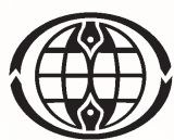
세계일보 Segye Ilbo

The Washington Times Foundation, established in 1984, is a not-for-profit organization devoted to encouraging the highest ideals in cultural values and public mindedness. The Foundation has developed, particularly in the areas of media and journalism, programs to promote the values of faith, freedom, and family. Forums and programs are regularly sponsored on a variety of cultural and historical activities for educational and personal enrichment. The foundation especially seeks to inform and prepare leaders to meet the increasingly complex and difficult global challenges that we can expect in the 21st century.