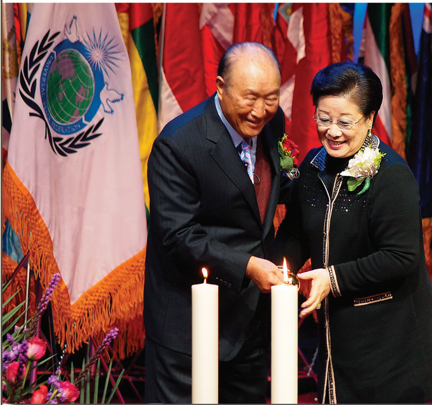
Founders: Rev. Dr. Sun Myung Moon and Dr. Hak Ja Han Moon