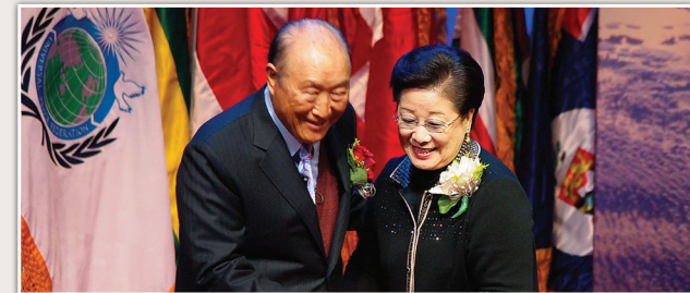
Rev. Dr. Sun Myung Moon and Dr. Hak Ja Han Moon Founders, UPF International