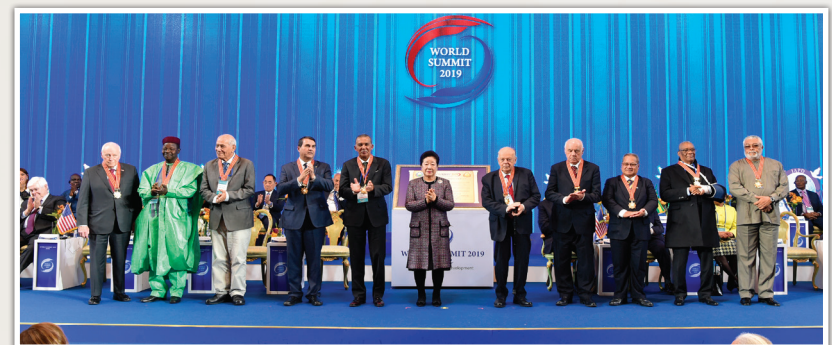
World Summit 2019. Seoul, Korea, February 8, 2019

International Leadership Conferences, symposia, and peace councils offer opportunities for capacity-building among leaders from all sectors. Peace and security considerations are complemented by “track two” diplomacy and grass-roots programs that build support for a culture of peace.