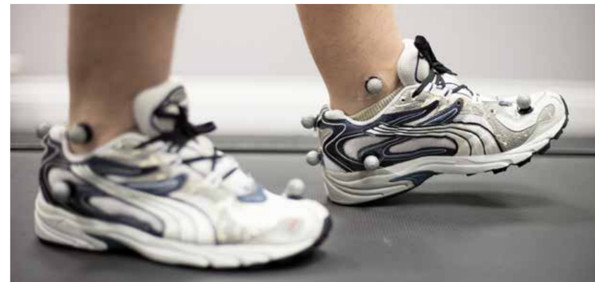
LEFT: Gait analysis offers a unique perspective on lower limb function BELOW: The Vicon 3D system is invaluable in treating sports injuries

the tests has proved invaluable in sports injuries as well as complex injury management and medico-legal work where we have produced numerous expert witness reports for the legal profession.