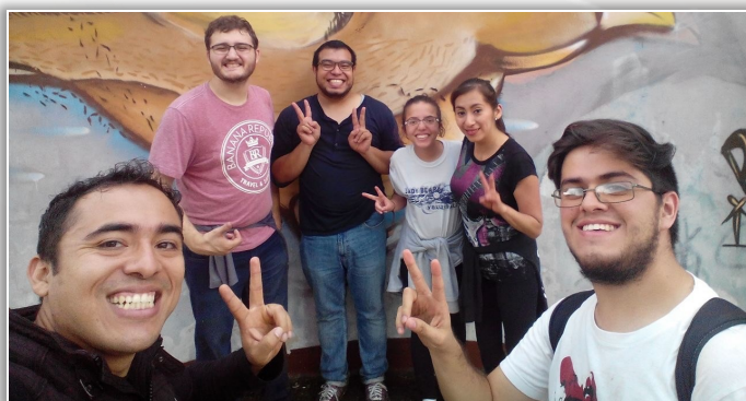
Gallaudet interns are pictured with two of the Mexican people they worked with.