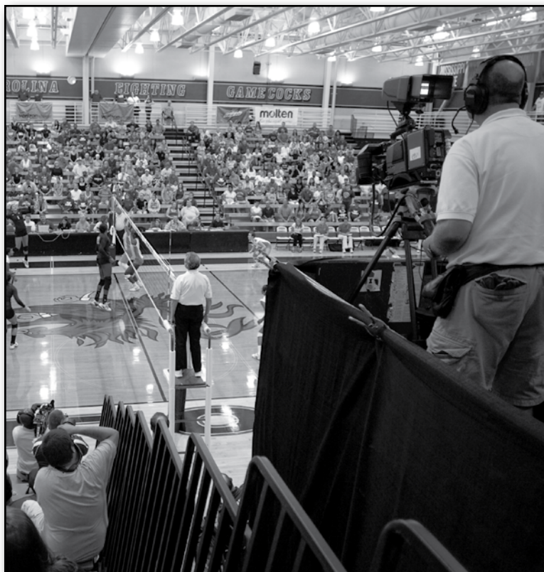
The Gamecocks were featured on television twice last season, including the five-set thriller against Clemson shown live on South Carolina ETV. South Carolina was 1-1 when broadcast last season, capturing this victory over the archrival Tigers.