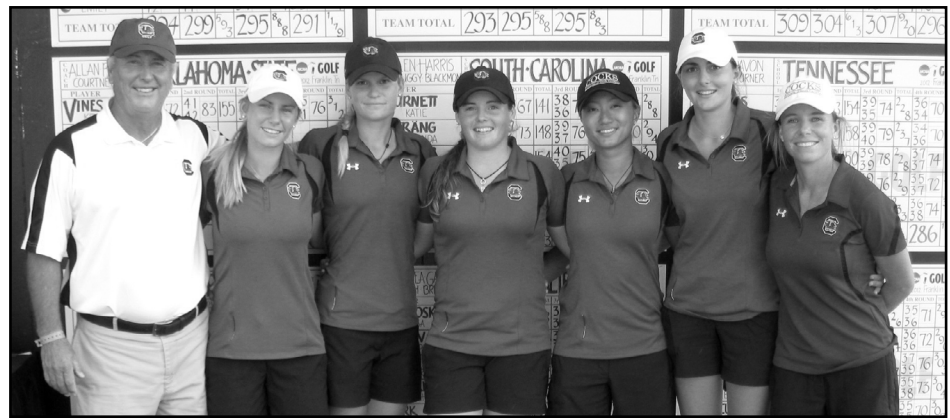
The 2012 Gamecocks posted the best NCAA Championship finish in school history, claiming fifth place at the Vanderbilt Legends Club in Franklin, Tenn.