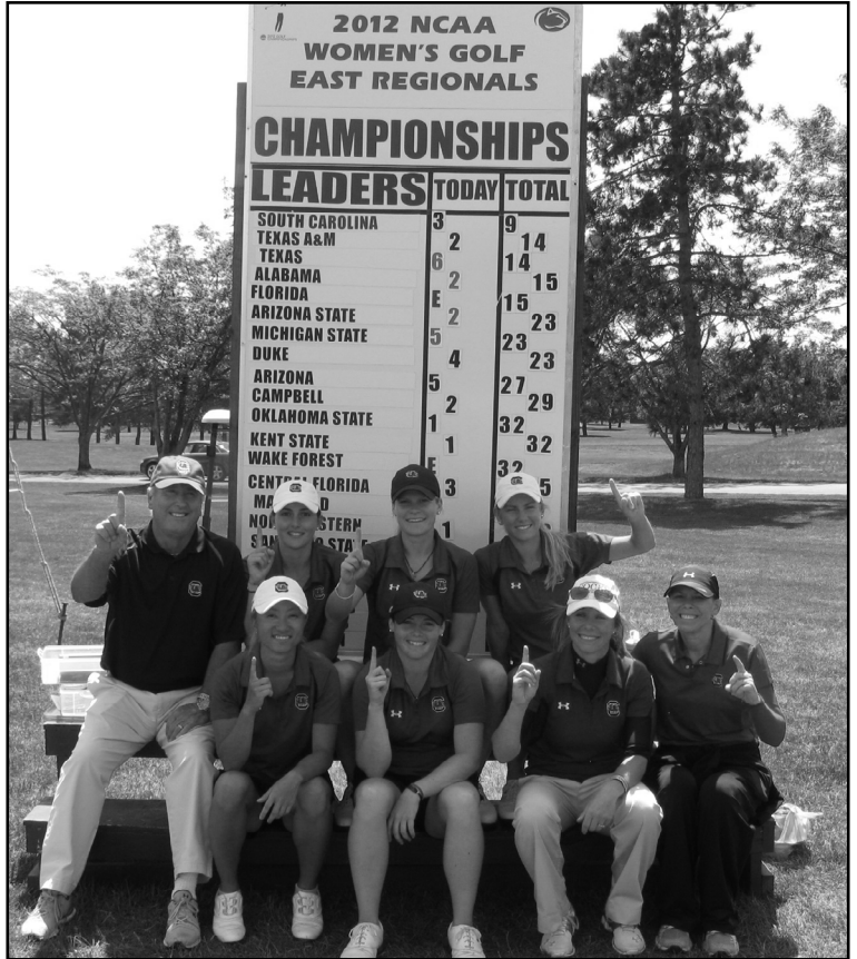
The Gamecocks won the 2012 NCAA East Regional title by five strokes with a three-round total of 873, which tied for the fifth lowest 54-hole total in school history.

The Gamecocks will now advance to the NCAA Championship for the fourth time in five years. This year's tournament will be held May 23-26 at the Vanderbilt Legends Club in Franklin, Tenn. South Carolina will be joined by SEC foes Alabama, Arkansas, Florida, LSU, Tennessee and Vanderbilt. The Gamecocks finished 18th at last year's NCAA Championship.