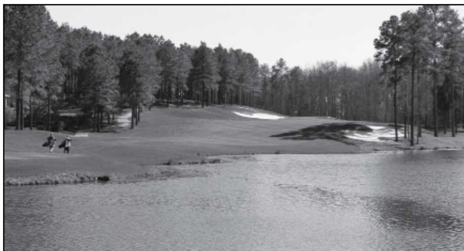
The Gamecocks' home course of Cobblestone Park played host to the SEC Women's Championship in 1997 and 2009.