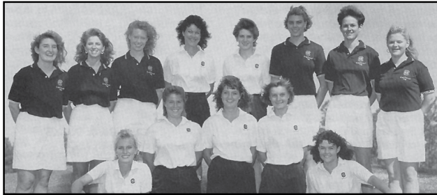
The 1989-90 Gamecocks finished in the top five of a school-record nine tournaments, including winning the Metro Conference Championship.