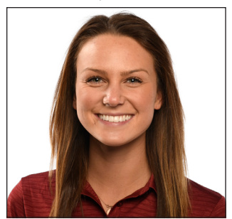
6-2 • Gr. Temecula, Calif.

3-2 as 1s pair / 20-6 overall / 7-6 vs. Top-20 Opponents