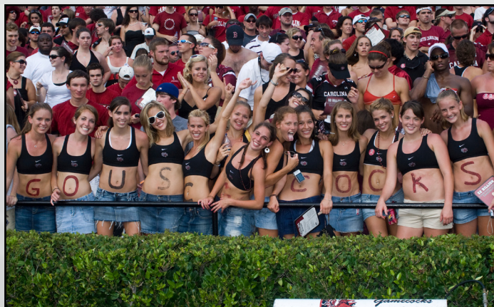
The team showing school spirit at a Gamecocks home football game during the 2008 season.

During her four years at Villa Joseph Marie, she was a member of the Latin Club and the Science National Honor Society. She