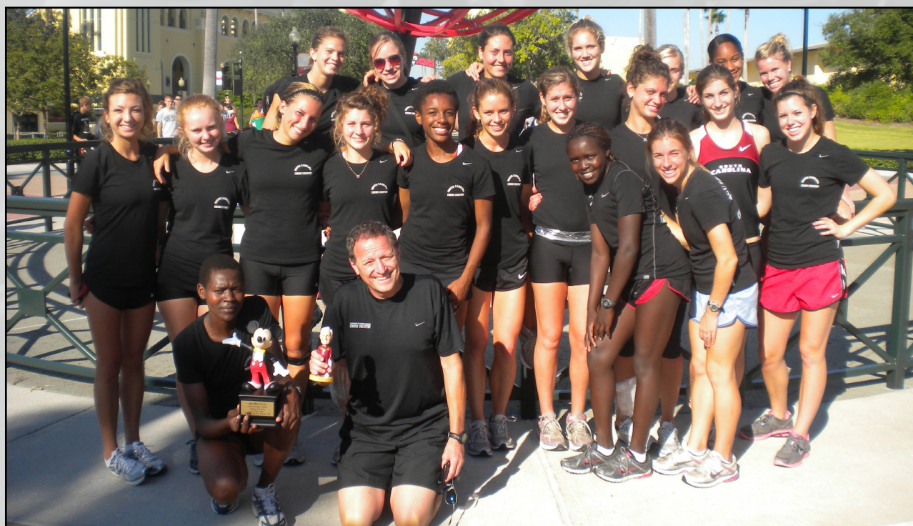
The Gamecocks won two meets during the 2010 season, including the Disney World Invitational in Orlando, Fla. Pictured above is the South Carolina team with the Mickey Mouse Trophy.

Tennessee will host the SEC Championships on Monday, Oct. 31, followed by the NCAA Southeast Region Championship race in Louisville, Ky. The NCAA finals are November 21 in Terre Haute, Ind.