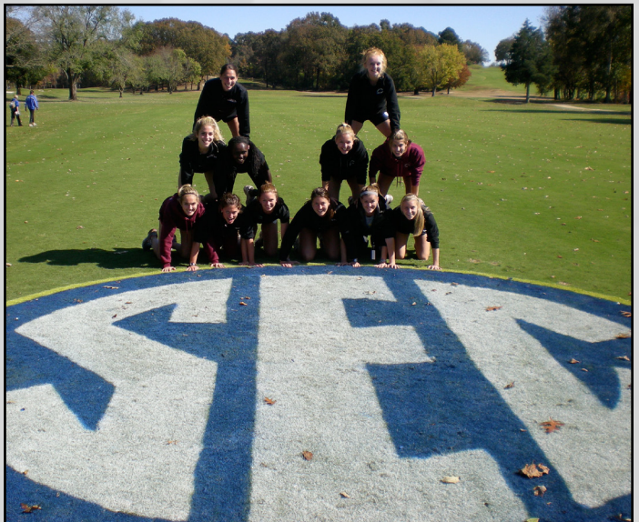
The Gamecocks having fun after the 2009 Southeastern Conference Championship in Oxford, Miss.