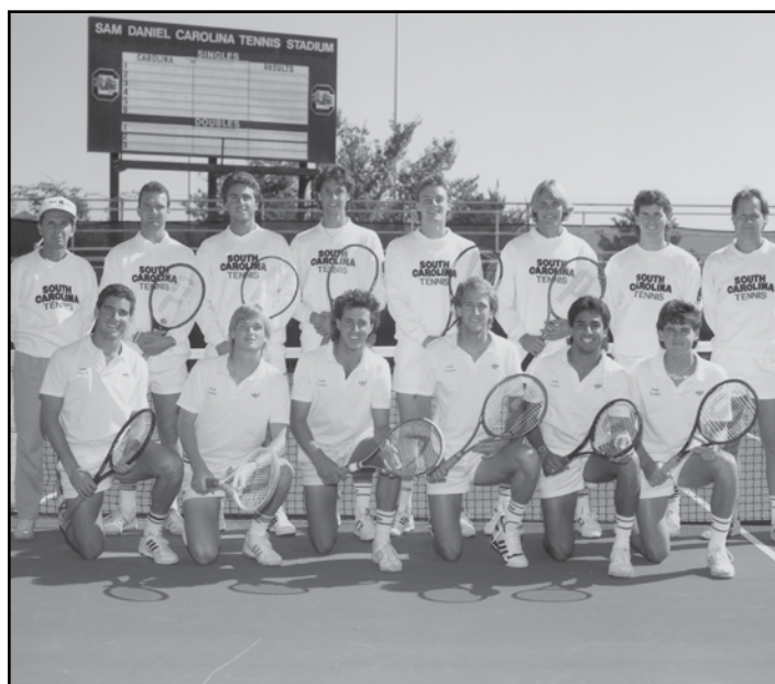
The 1989 Gamecocks reached to the NCAA semifinals, the furthest into the event any South Carolina team has advanced.