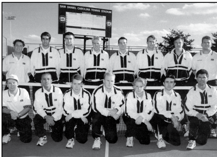
In 1998, South Carolina reached the NCAA Tournament "Sweet 16" for the first time since the event expanded to begin with regional play.