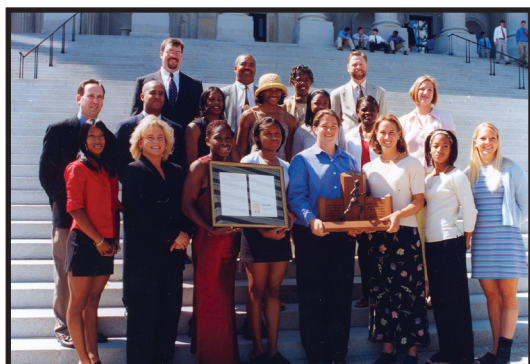
1999 SEC OUTDOOR CHAMPIONS