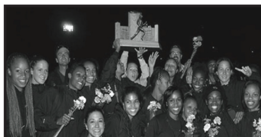
2002 SEC OUTDOOR CHAMPIONS