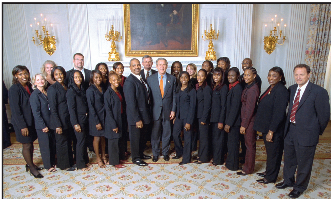
2002 NCAA OUTDOOR CHAMPIONS