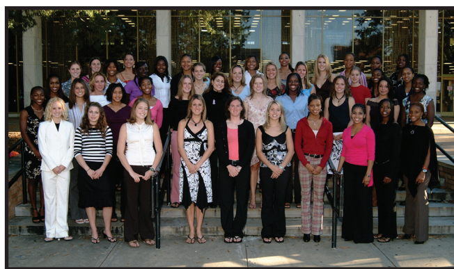
2005 SEC OUTDOOR CHAMPIONS