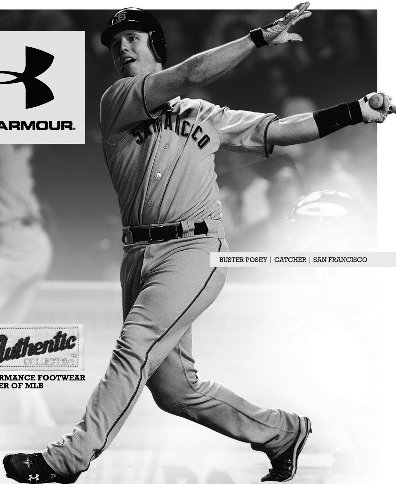
BUSTER POSEY | CATCHER | SAN FRANCISCO