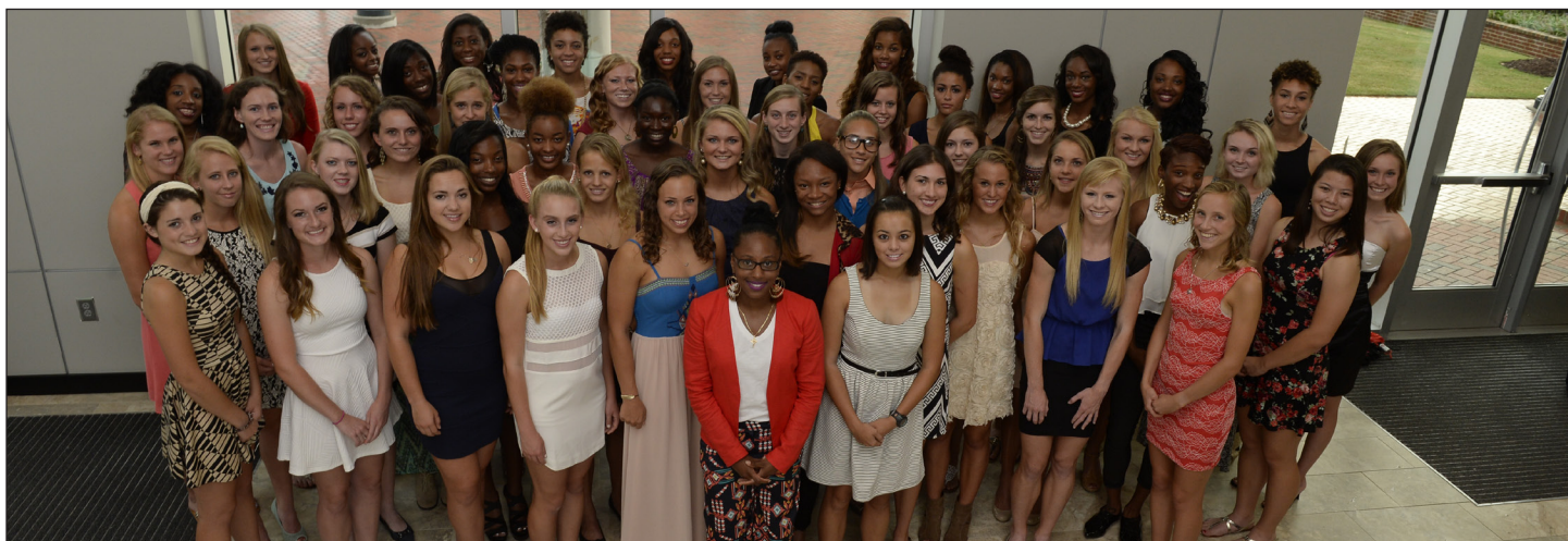
2015 Women's Track Team