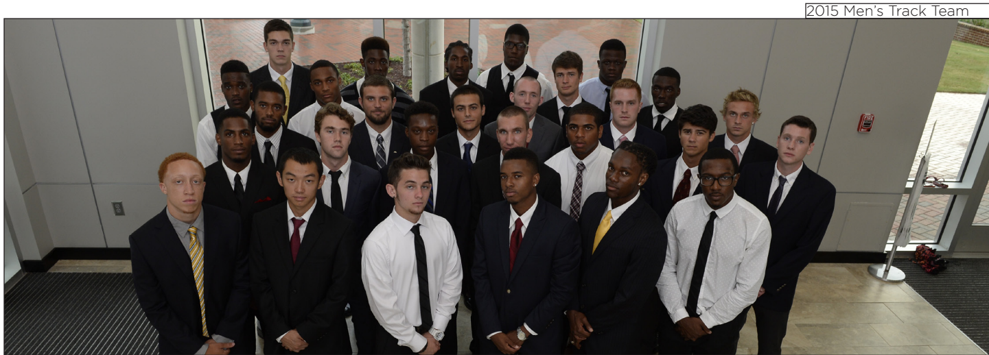
2015 Men's Track Team