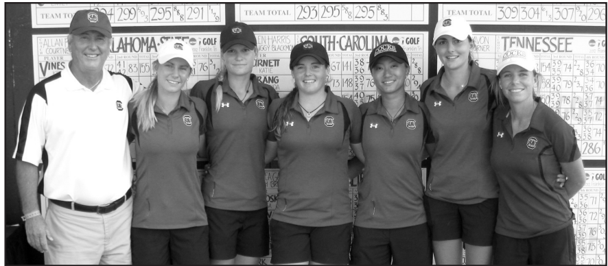
The 2012 Gamecocks posted the best NCAA Championship finish in school history, claiming fifth place at the Vanderbilt Legends Club in Franklin, Tenn.