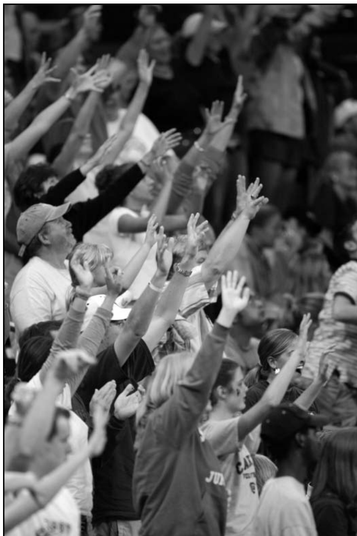
Large crowds can be found at the Volleyball Competition Facility on game days. The largest throng in history came Sept. 21, 2001, when the Gamecocks hosted Florida in front of 1,793 fans.