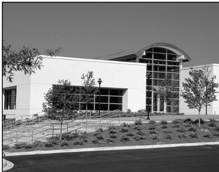
South Carolina's Volleyball Competition Facility opened for the 1996 season. It was completed at a cost of $4.6 million and features a seating capacity of 2,000. The building also houses the volleyball staff.