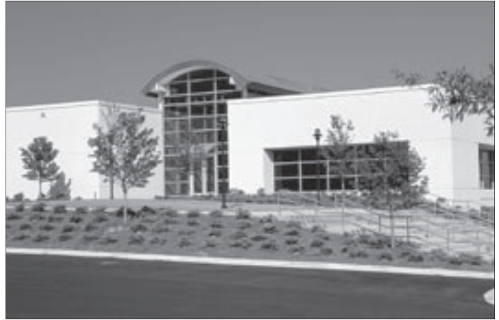
The volleyball and basketball offices are also located in the Volleyball Competition Facility.