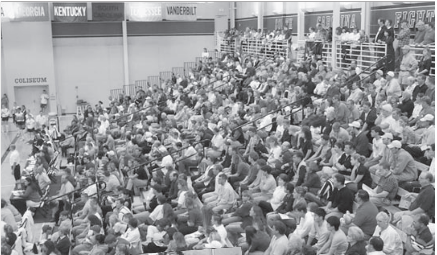
Year after year the attendance at Gamecock volleyball continues to grow. Carolina consistently ranks among the top two teams in attendance in the SEC. The Volleyball Competition Facility holds the attendance record for the largest crowd to ever witness a match in the state of South Carolina when 1,793 fans watched USC host Florida on Sept. 21, 2001.