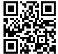
3/4 UC Davis