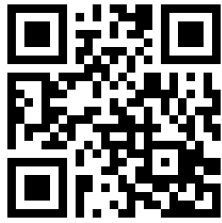
2/11 Western Ky.