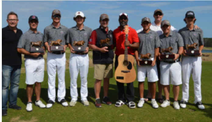
The team poses with South Carolina alum and country music star Darius Rucker at Bulls Bay Golf Club after three-peating as champions of the Hootie At Bulls Bay Intercollegiate on March 28, 2017.