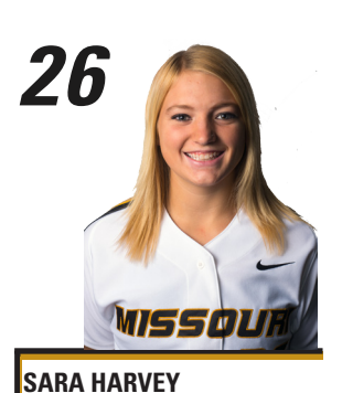
IF // 5-8 // FR // L/L Kansas City, Mo. (Staley HS)