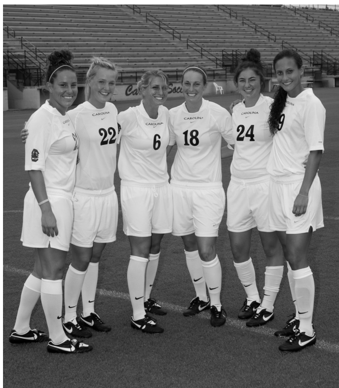
CLASS OF 2009