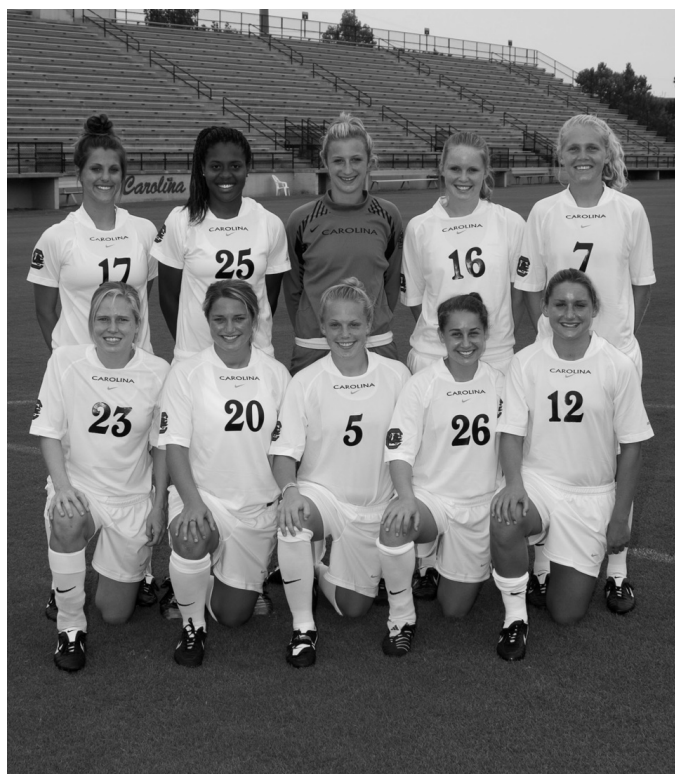
CLASS OF 2010