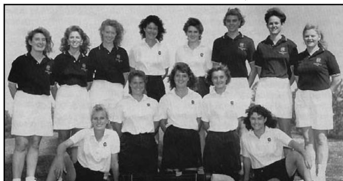
The 1989-90 Gamecocks finished in the top five of a school-record nine tournaments, including winning the Metro Conference Championship.