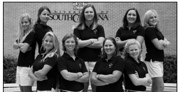
The 2006-07 squad recorded a school-record 302.59 stroke average.

* Kalen Anderson took over as head coach in February 2008