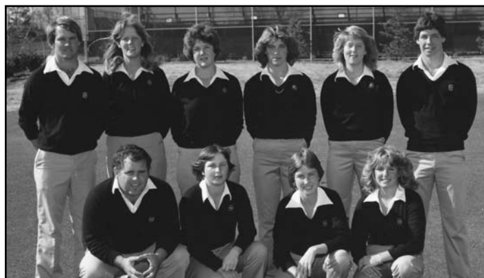
Women's golf joined the department of athletics in 1980-81 and immediately made its mark on collegiate golf in the area, winning three tournaments in its inaugural season.