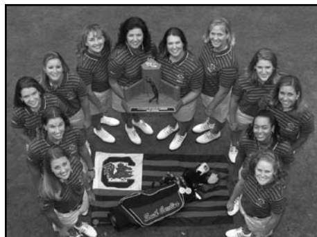
South Carolina brought the 2002 SEC Championship trophy home to Columbia.