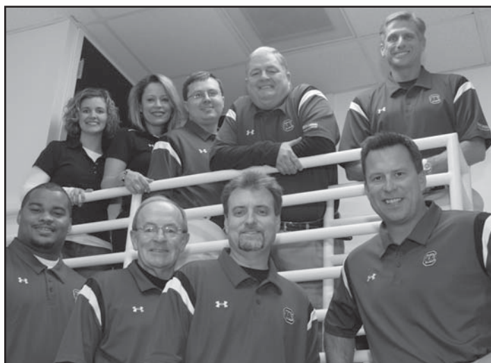
The South Carolina Radio Crew: