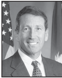
Mark Sanford Governor of South Carolina (ex-officio Chairman)