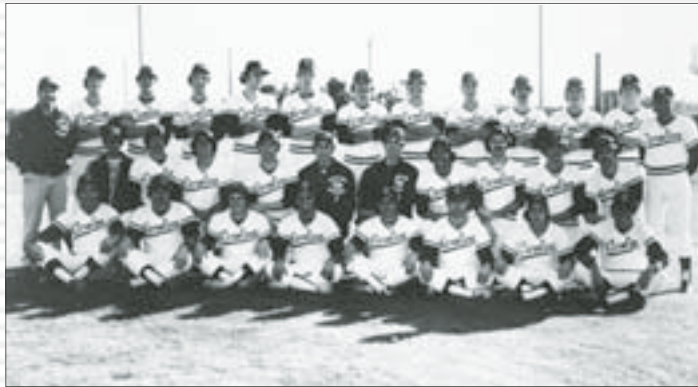
1975 • 51-6-1 • 2nd at CWS