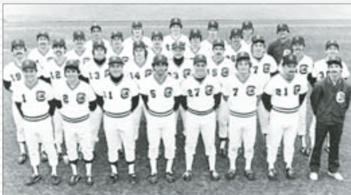
1981 • 46-15 • 4th at CWS