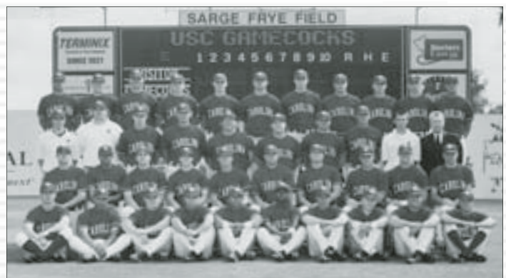
2004 • 53-17 • 3rd at CWS

20 NCAA Appearances 1974-77, 1980-88, 1992-93, 1998, 2000-04