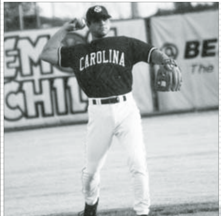
Brian Roberts has spent the last three seasons playing as a member of the Baltimore Orioles.