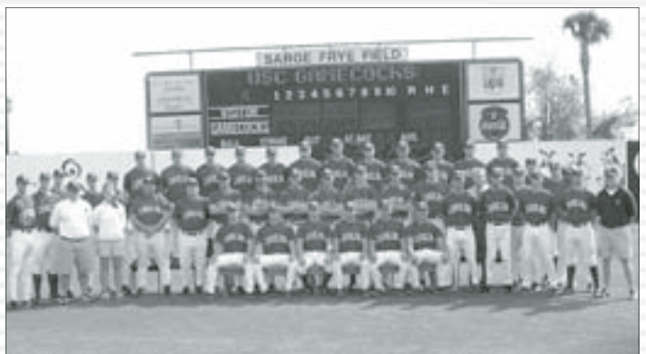
2002 • 57-18 • 2nd at CWS