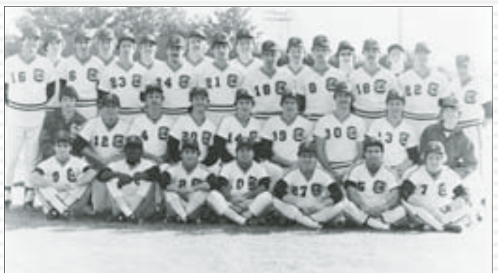
1982 • 45-13 • 7th at CWS