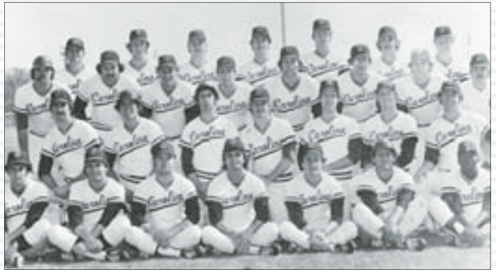
1977 • 43-12-1 • 2nd at CWS