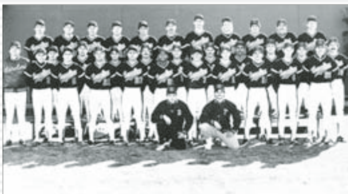
1985 • 47-22 • 7th at CWS