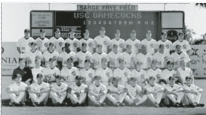
2003 • 45-22 • 6th at CWS