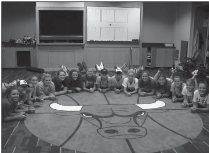
Before the Evanston Super Regional, the Gamecocks toured Chicago and even got inside the Chicago Bulls' locker room, shown here.