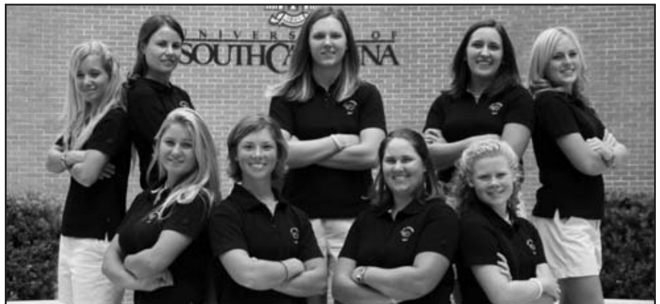
The 2006-07 squad recorded a school-record 302.59 stroke average.