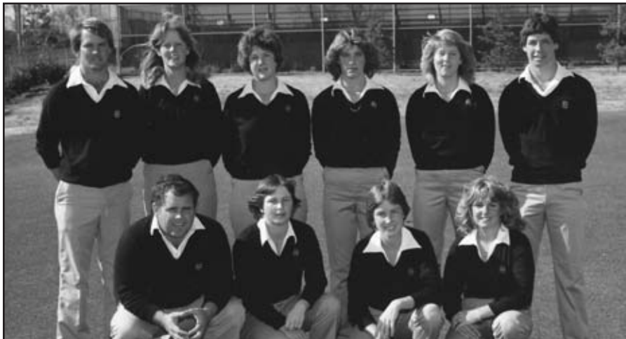
Women's golf joined the department of athletics in 1980-81 and immediately made its mark on collegiate golf in the area, winning three tournaments in its inaugural season.