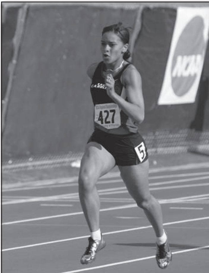
2008 SOUTH CAROLINA TRACK & FIELD