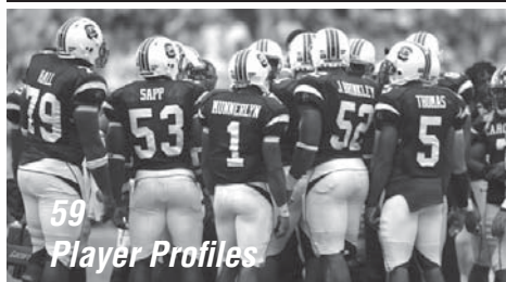
59 Player Profiles