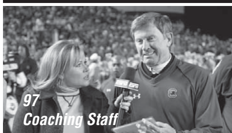
97 Coaching Staff