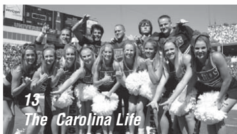
13 The Carolina Life