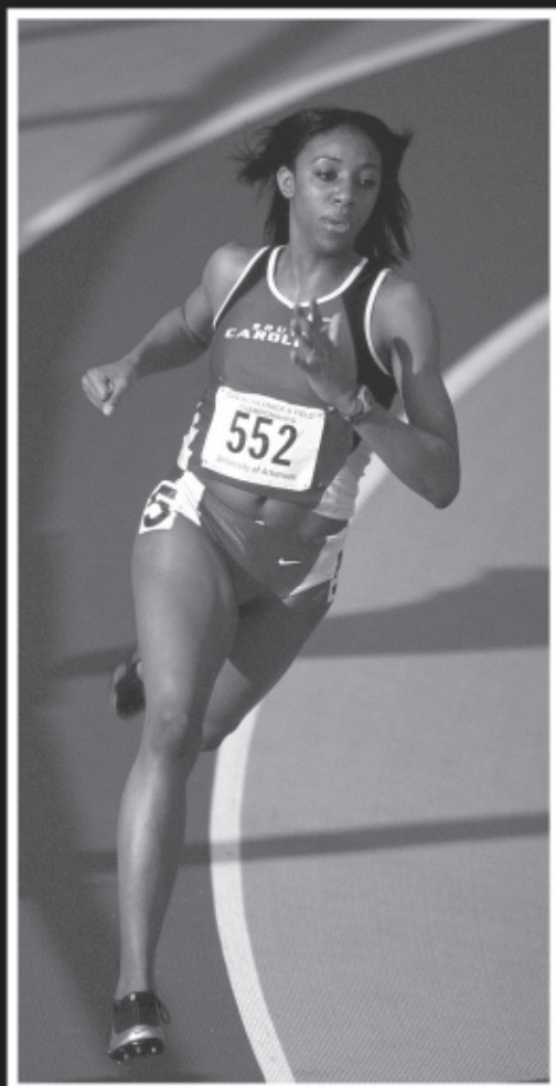
Lashinda Demus won the NCAA Indoor 400m Championship with a season-best time in Fayetteville, Ark.