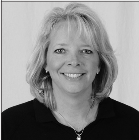
Coaching Timeline South Carolina, head coach 1997-present

:: South Carolina's 2007 recruiting class was ranked 18th nationally by The Collegiate Girls Basketball Report .