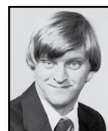
Mac Credille Equipment