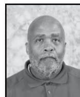
Mel Parker Facility Scheduling