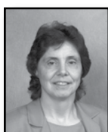
Kelly Lewis Fieldhouse