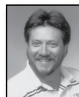
Mike Smith Stadium Maintenance