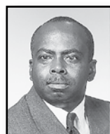
Joe Sumter Equipment