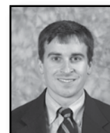
Clay Wilson Ticket Office