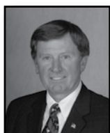
Steve Spurrier Head Football Coach