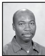
Eddie Dunning Grounds