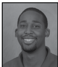
Freddy Ready Support