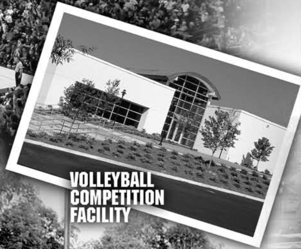
VOLLEYBALL COMPETITION FACILITY