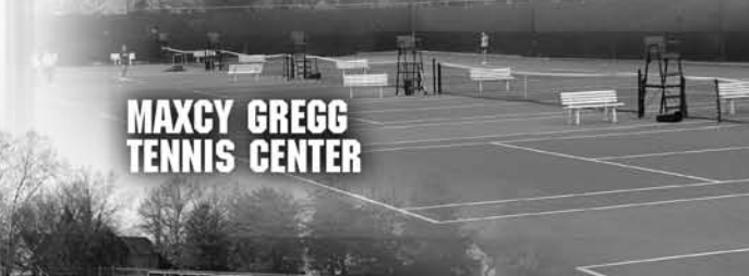
MAXCY GREGG TENNIS CENTER