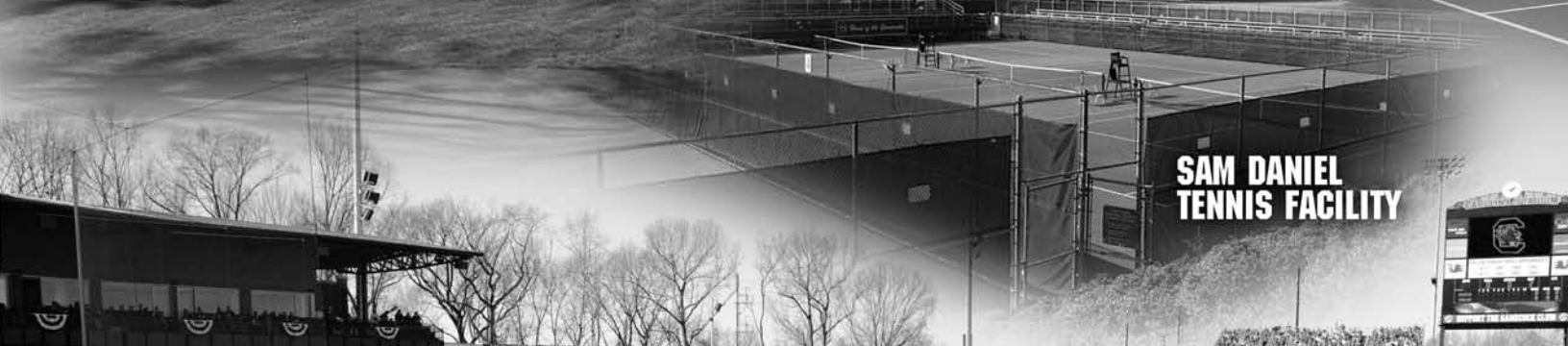
SAM DANIEL TENNIS FACILITY