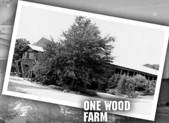
ONE WOOD FARM