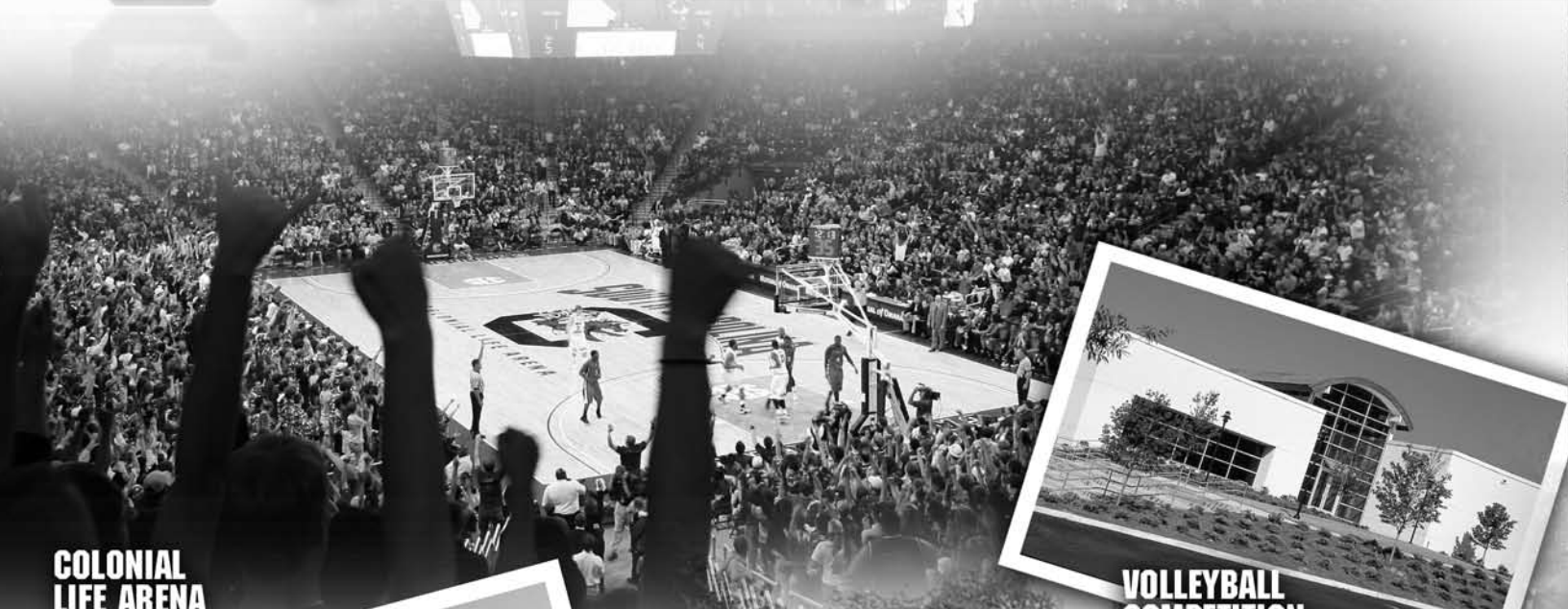
COLONIAL LIFE ARENA