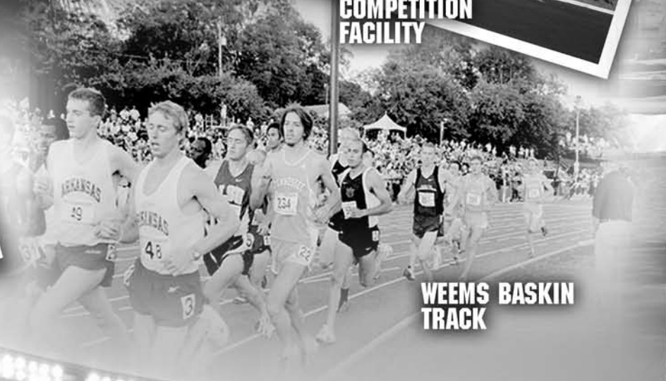
WEEMS BASKIN TRACK