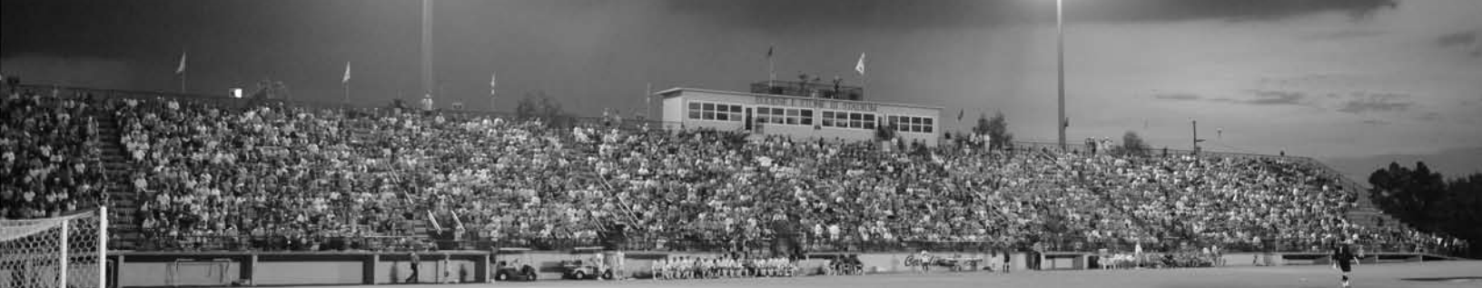
EUGENE E. STONE III STADIUM