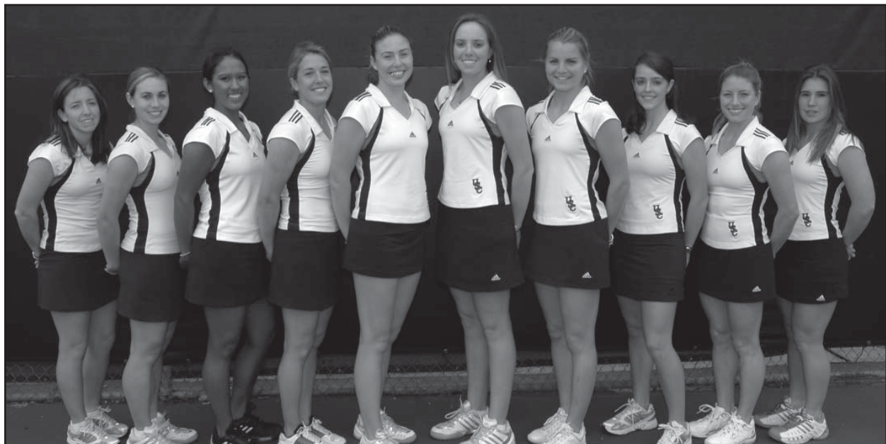
The 2004-05 South Carolina Women's Tennis Team