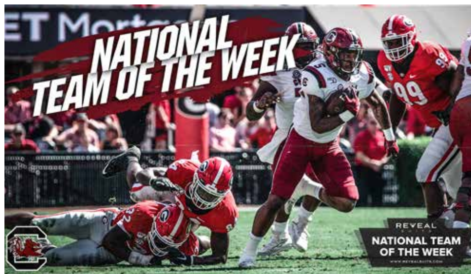
The Gamecocks were selected as the Reveal National Team of the Week following their upset double-overtime win over Georgia in 2019.