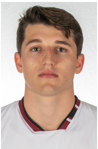
Parker League #22 - Senior