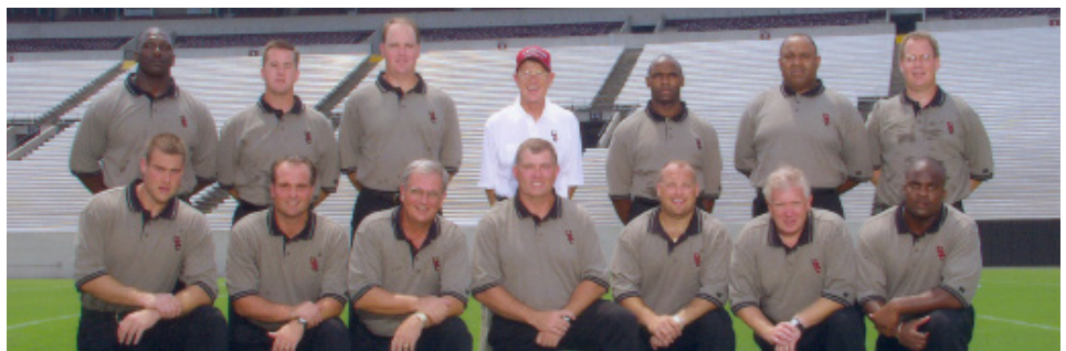
2021 SOUTH CAROLINA COACHING STAFF

THE POWER OF FIVE: Since the turn of the century, the Gamecocks have a 51-4 mark against teams not currently in a Power-5 conference. The only four losses in that stretch came to UConn in the 2010 Papajohns.com Bowl, to The Citadel in 2015, to USF in the 2016 Birmingham Bowl and to Appalachian State in 2019. It should be noted that UConn was in the Big East, which was a BCS automatic qualifier during the 2009 season.