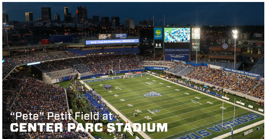
"Pete" Petit Field at CENTER PARC STADIUM