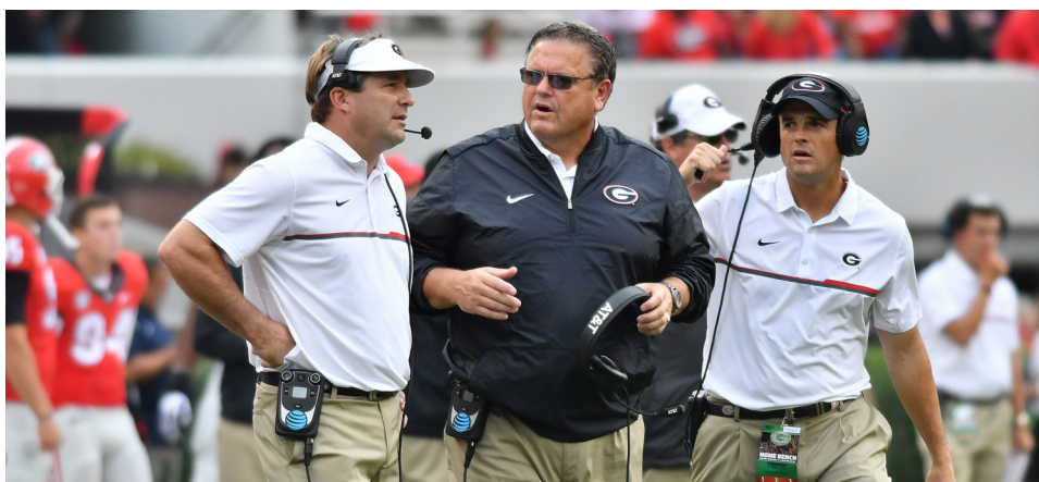
Kirby Smart, Sam Pittman and Shane Beamer

♦ For the third-straight week, South Carolina head coach Shane Beamer will be facing a former coaching colleague. Coach Beamer was on Kirby Smart's staff at Georgia in 2016 and 2017. The 2016 squad went 8-5 and defeated TCU in the Liberty Bowl. The 2017 Bulldogs defeated Oklahoma in the Rose Bowl, then lost to Alabama in the CFP Championship game by a 26-23 score to finish 13-2. Last week, Coach Beamer faced Arkansas head coach Sam Pittman. Pittman was also part of the 2016 and '17 staffs at Georgia. In the season opener, Coach Beamer went head-to-head with Georgia State head coach Shawn Elliott. Both Beamer and Elliott were on the 2010 South Carolina staff under head coach Steve Spurrier.