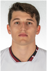
Parker League #22 - Senior