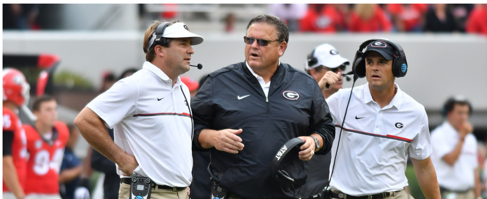
Kirby Smart, Sam Pittman and Shane Beamer