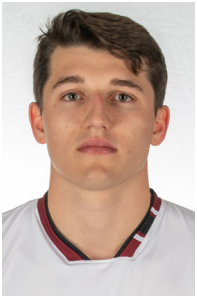
Parker League #22 - Senior