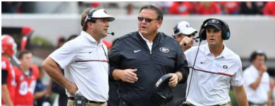
Kirby Smart, Sam Pittman and Shane Beamer