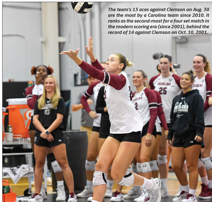
The team's 13 aces against Clemson on Aug. 30 are the most by a Carolina team since 2010. It ranks as the second-most for a four set match in the modern scoring era (since 2001), behind the record of 14 against Clemson on Oct. 10, 2001.